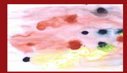
Manya Desai | EYP 2 B