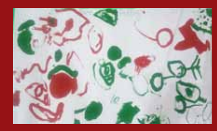
Group Activity | Junior Kg. D