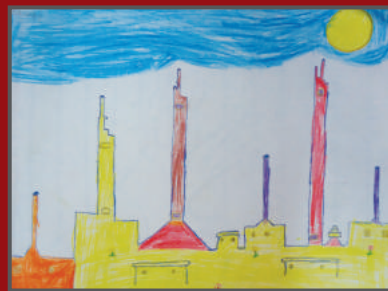
Jeet - Class 4