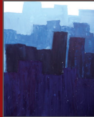
Rajsi - Class 5