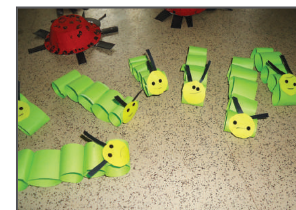
Group Activity - Jr.Kg. A Caterpillar Making