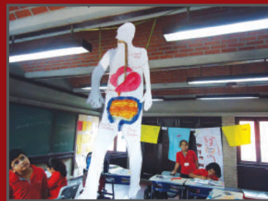
Group Activity - Class 6 Diestive system