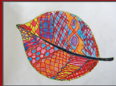
Prerna - Class 7