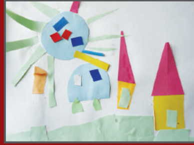
Soham & Ayushi - Class 1