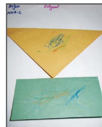
Arjun Mittal - Nur. C Origami Paper Folding