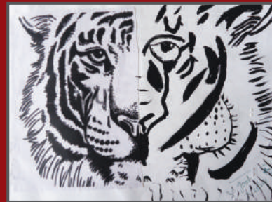
Paras - Class 7