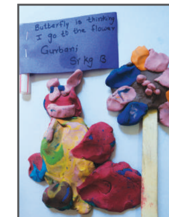
Gurbani Parayani - Sr.Kg B Clay Moulding