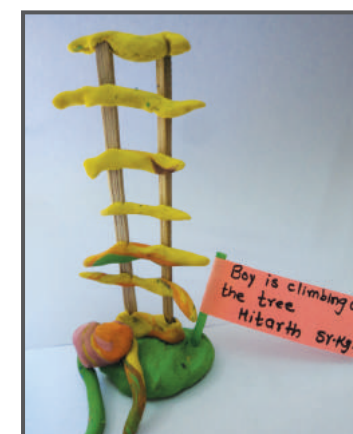
Hitarth Shah - Sr.Kg B Clay Moulding