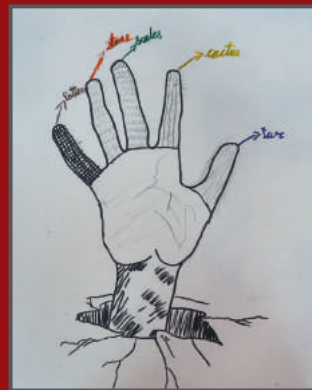
Veli - Class 4