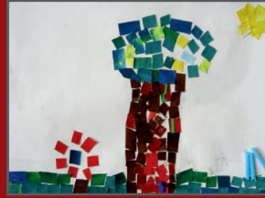
Aditya - Class 2