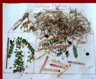
Group Activity | Nursery