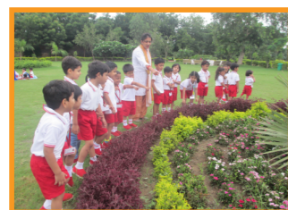
Playgroup Field Trip to AMC Garden

Senior Kg.: Children visited a house backyard having a tree house as a part of their play project. Their purpose was to explore the tree house there, as part of the process of making their own tree house. Other children visited the children’s park at Karnavati Club where they observed different climbing frames and types of slides.