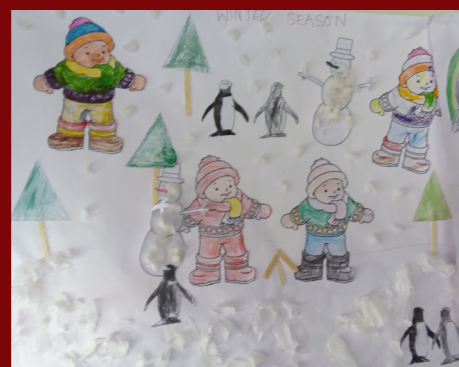
Group Activity | Junior Kg.