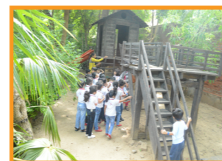
Senior Kg. Field Trip to explore a Tree-house