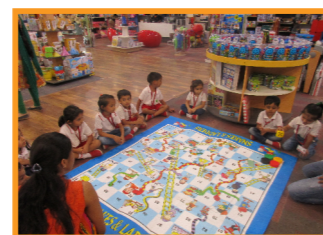
Junior Kg. Field Trip to Toyra