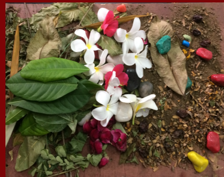
Group Activity | Playgroup