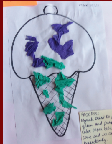
Myra Desai | Playgroup