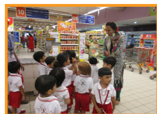
Nursery Field Trip to Star Bazar