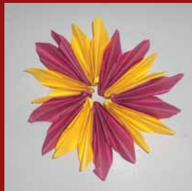
Class 2 - Paper folding art