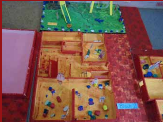
Class 1 - Model of School's interiors