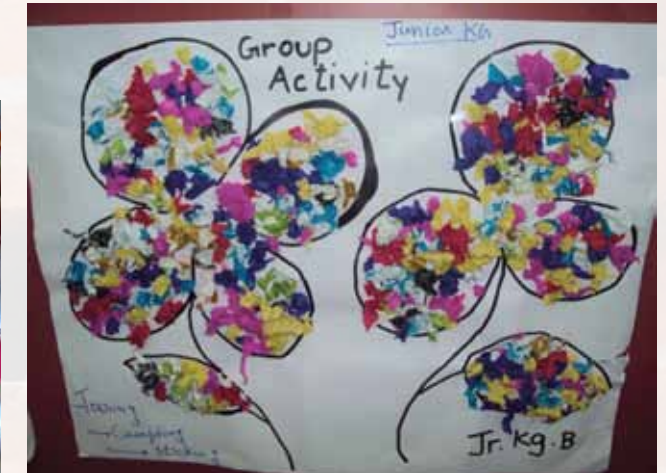
Jr.kg - Paper Crumbling