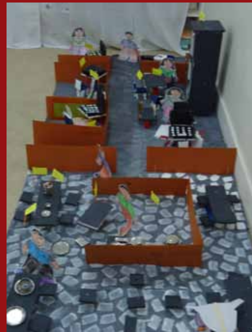
Class 3- Model of Claris Headquarters