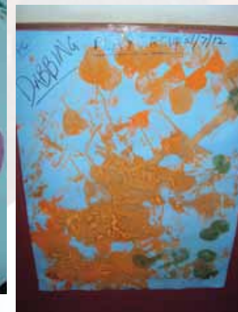
Playgroup - Sponge Dabbing