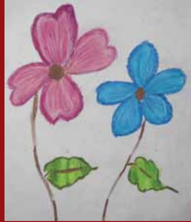
Class 2 - Shading by Drashti