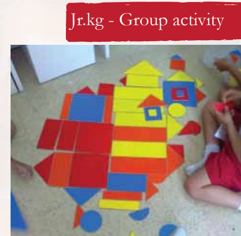
Jr.kg - Group activity