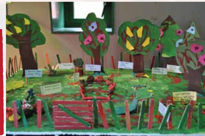
Jr.kg - Garden