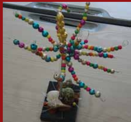
Class 4 and 5 - Art work using materials