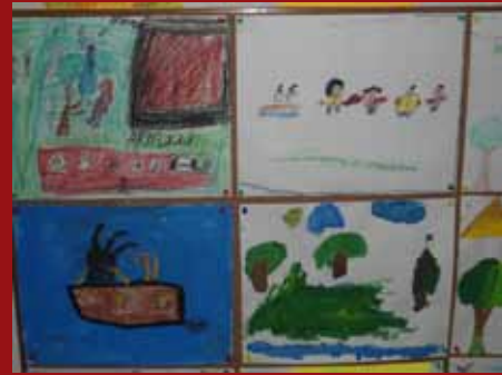
Class 3 - Art work