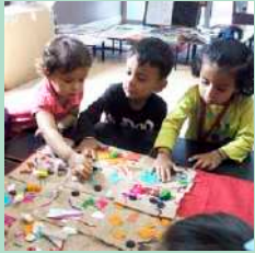
This is our wall hanging with so many colorful things.