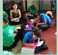
A self reflective journey of their past and their own experiences.