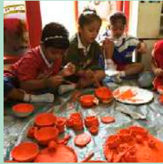
An orange dinner set we made with paper clay.