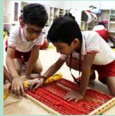
Here we go 'up & down' to make our hand woven carpet.