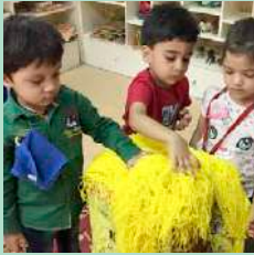
Wow, the lion's hair is so soft to touch. We had fun pasting it.