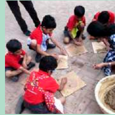
Learning the traditional art of Lippan using clayey soil and dung.